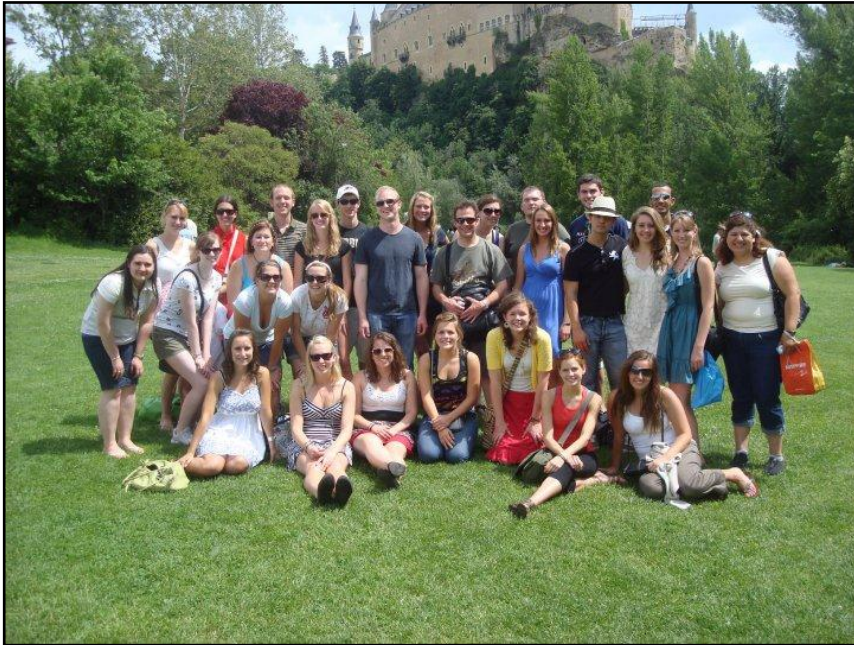
FLL Students and Faculty on a summer study abroad in Madrid, Spain